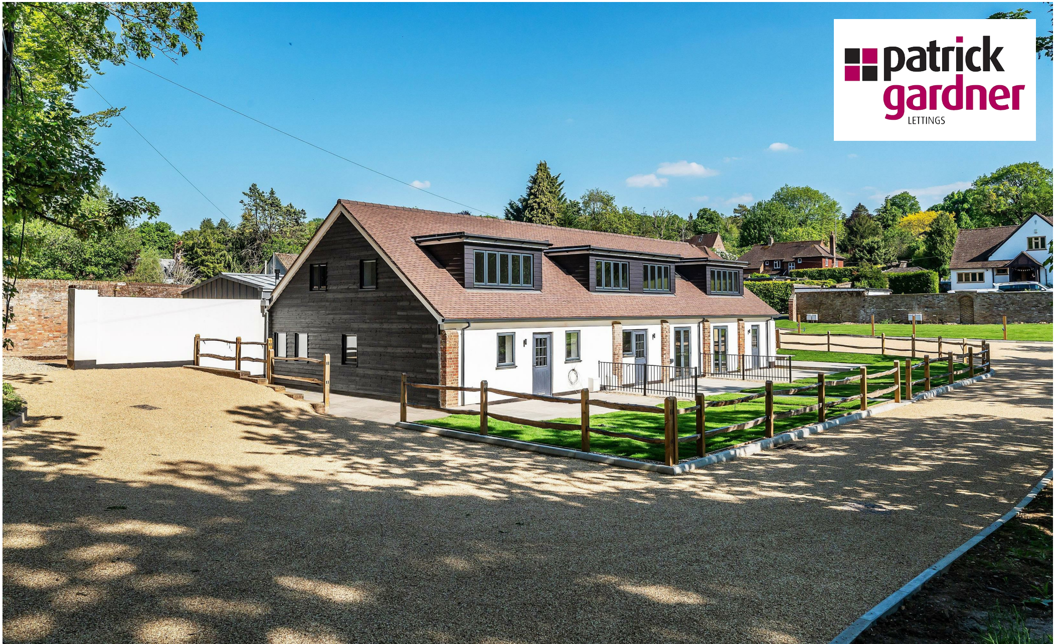
Garden Close, Leatherhead, KT22 8LU